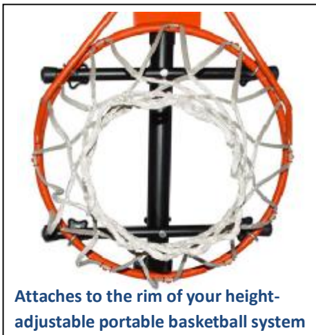
Attaches to the rim of your height-adjustable portable basketball system